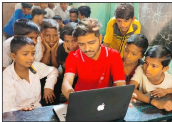
Community Outreach Services Activity