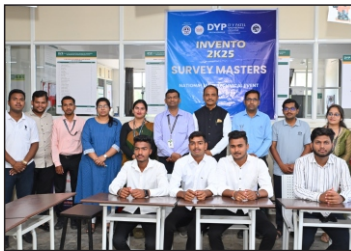
Survey Masters (Invento 2025)