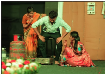
SPANDAN 2K24 DRAMA at Annual Social