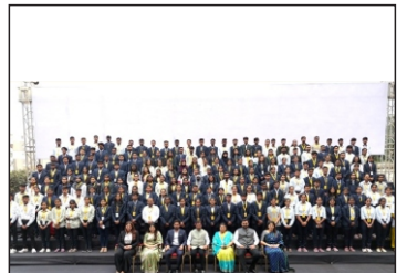
Sou. Shantadevi D. Patil Merit Scholarship Award 2024-25