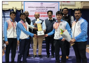
Sport Achievements at university level