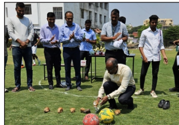
Sports Inauguration 2025