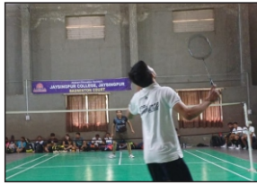
University Level Badminton Competition