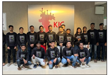
Google Developer Students Club