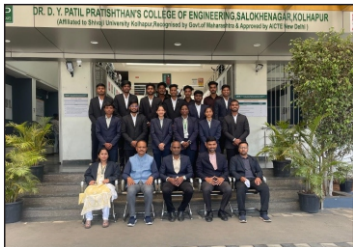
Top Placements of A. Y. 2025-2026