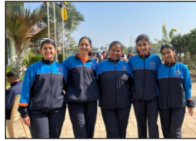
All India National Level 2025 organized at Reva, Madhya Pradesh