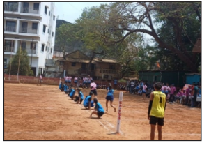
Shivaji Vidyapeeth Lead Women's Kho Kho Tournament