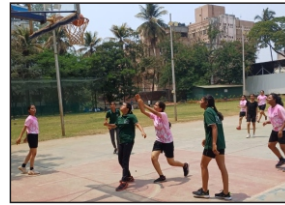
Shivaji Vidyapeeth Women's basketball tournament