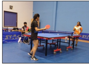
Sport Achievements at university level