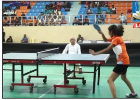
State level Aswamedh 2025 Competition