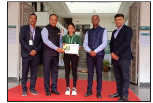
Lead College Runner-up 2024