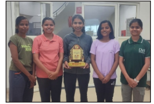
Lead College Runner-up 2025