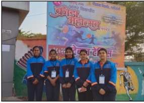
Aswamedh State Level Tournament 2025 Gadchiroli Chandrapur