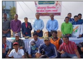
Kolhapur District Baseball Competition