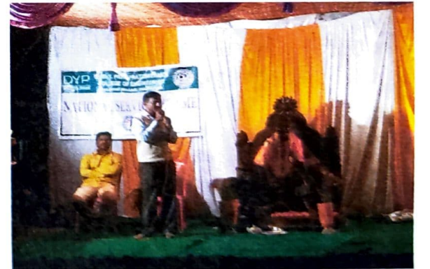
Celebration of Chatrapati Shivaji mahara jayanti at village Kandalgaon during the NSS camp.