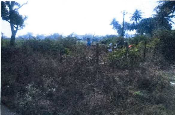
View of village well used for drinking water before cleanliness activity conducted in camp.