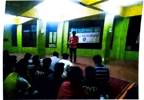
Every evening for seven days expert lectures from different fields are arranged in the camp.