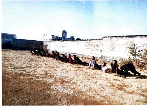
Every day morning exercise activities conducted by volunteers participated in camp.