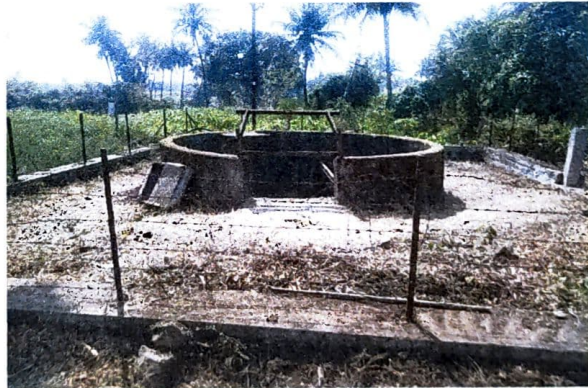
View of village well used for drinking water after cleanliness activity conducted in camp.