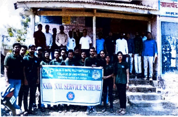
Inauguration of seven days residential NSS Camp at Kandalgaon grampanchayat office.