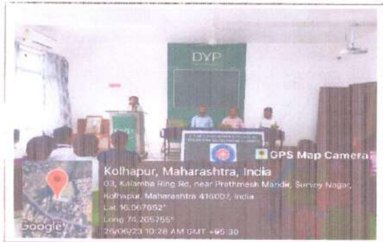
Photo Gallery Chh. Shahu Maharaj Jayanti