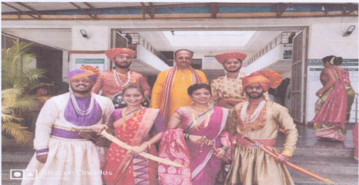
Traditional Day 2022