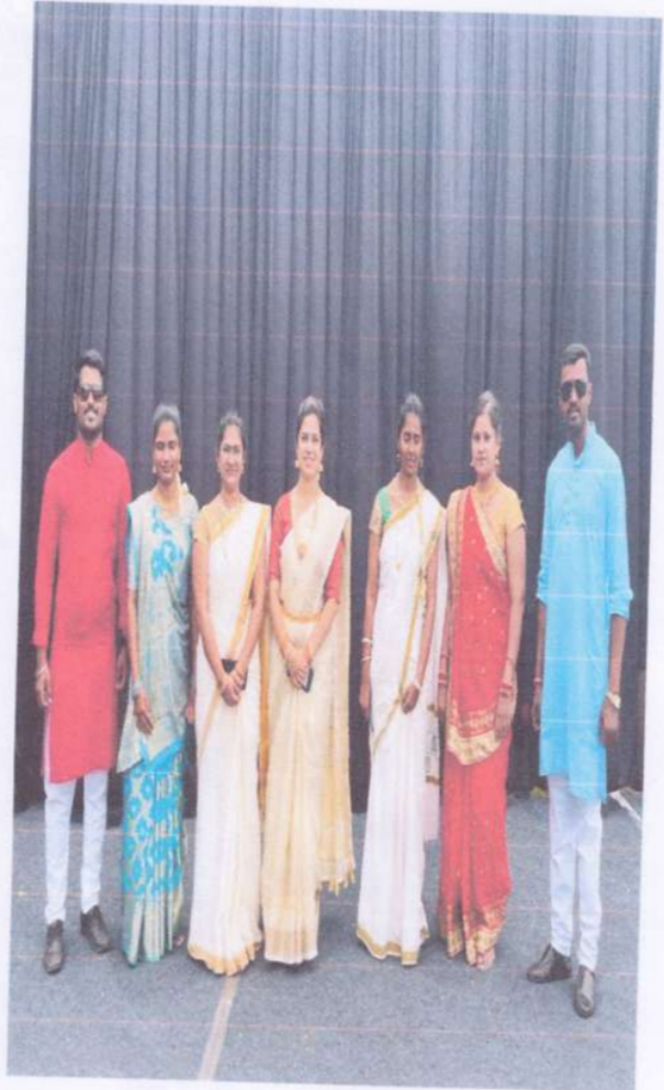
Traditional Day Celebration 2023