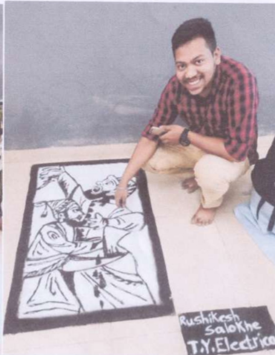
Shivaji Maharaj Jayanti Celebration