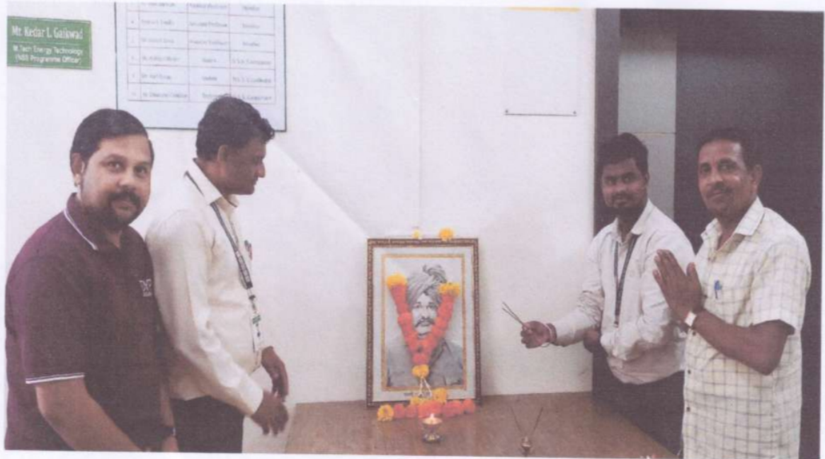
Rajarshi Shahu Maharaj Jayanti Celebrations

Dr. D. Y. Patil Pratishthan's College of Engineering, Salokhe Nagar, Kolhapur.