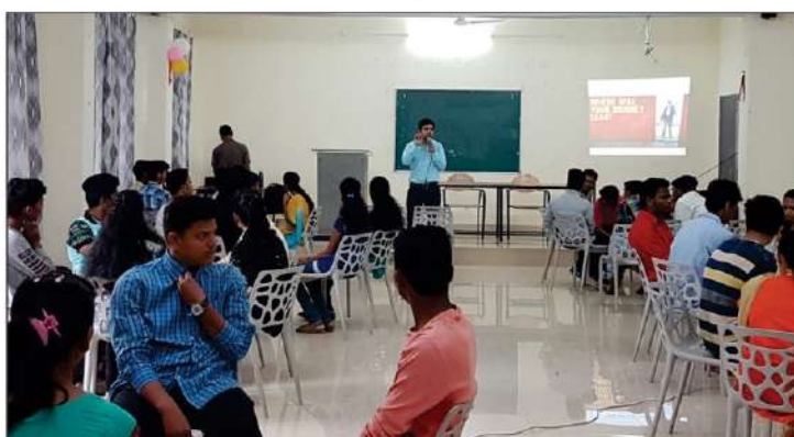
Training by Campus 4u