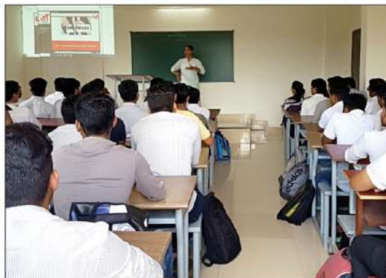
Lecture by Barclays