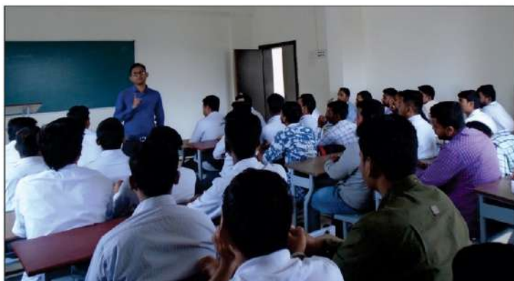
Lecture by Hireme