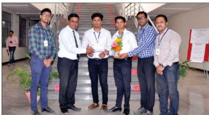
Felicitation of Team Homzhub