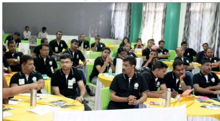
Ma-TPO Summit at DYP Salokhenagar