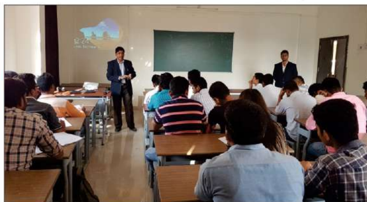
Training by O2 Breathing