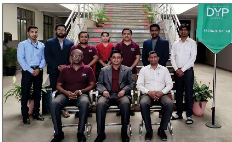
Department of Civil Engg.