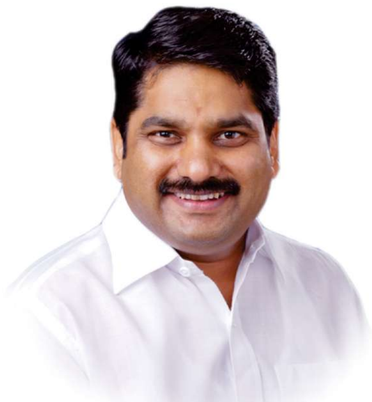
Hon. Shri. Satej alias Bunty D. Patil

Member of Legislative Council – Maharashtra, Kolhapur Minister of State for Home (Urban), Housing, Transport, Information Technology, Parliamentary Affairs & Ex. Servicemen Welfare, Govt. of Maharashtra.