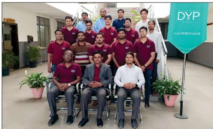
Department of Mechanical Engg.