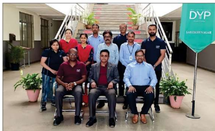
Non Teaching Staff