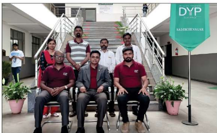
Department of General Sci. & Engg.