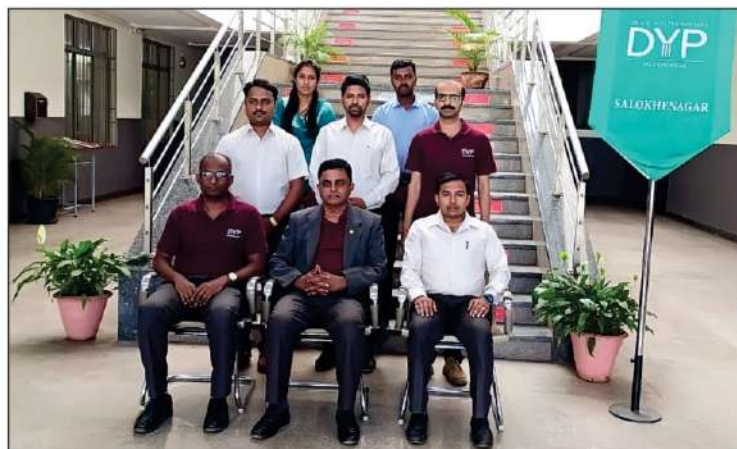
Department of Computer Sci. & Engg.